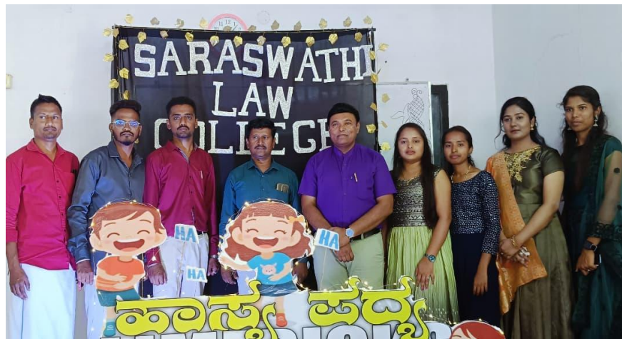
Students’ participation in various scheduled events