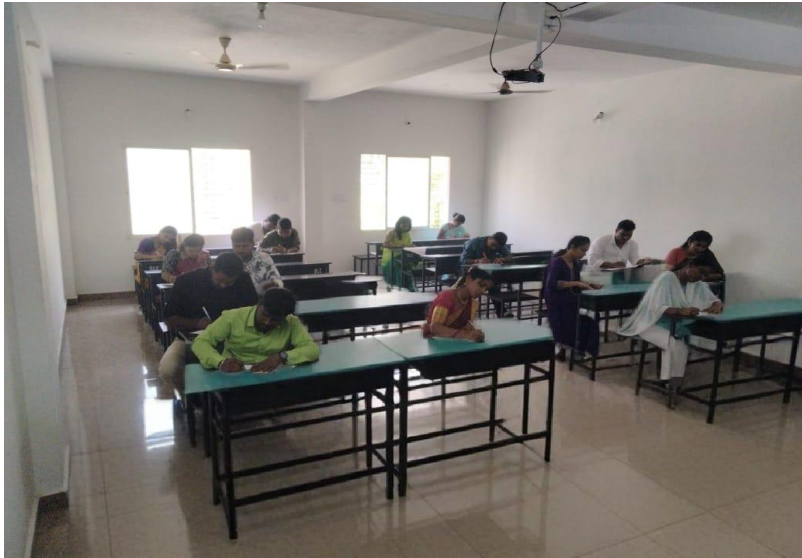
Students participation in Essay competition

After the engaging morning sessions, everyone regrouped post-lunch for the grand finale of the fest — a vibrant showcase of talent and celebration.