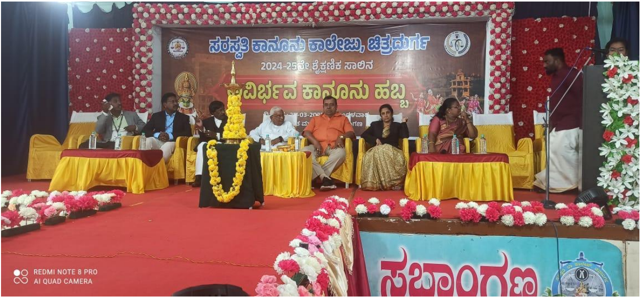
Photographs of Inauguration Ceremony