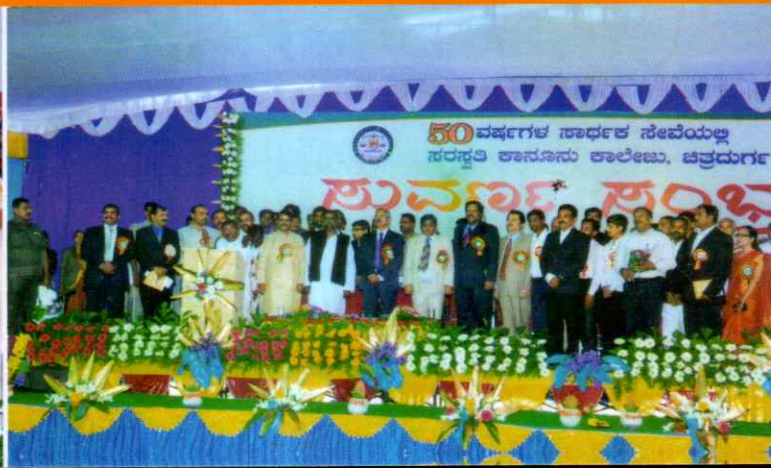
Hon'ble H.L. Dattu, Chief Justice of India