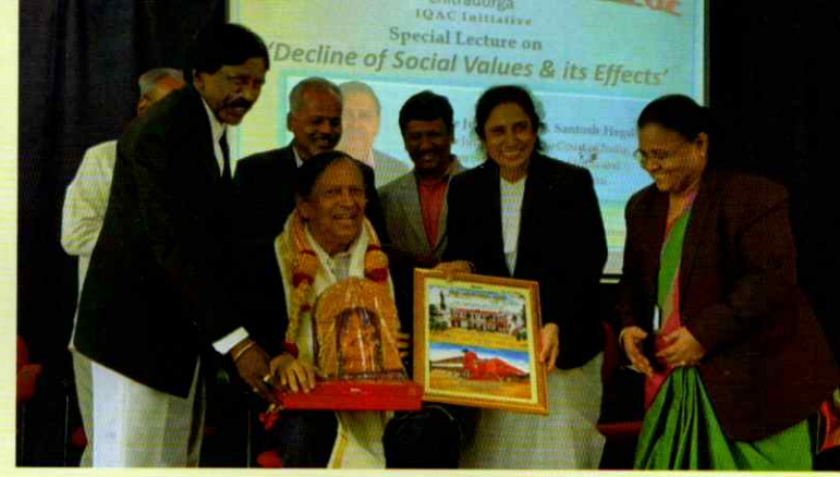
Hon'ble Justice Santhosh Hegde