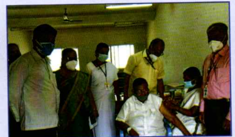
Covid Vaccine Camp