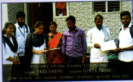
Survey in Village

BHGC+GBQ, D.K.Hally, Karnataka 571524, India Latitude: 14.13.5491N Longitude: 076.28.2838E LOCAL: 16.20.46 GMT: 12.31.01 SATURDAY 26.03.2022 ALTITUDE: 2295 FEET