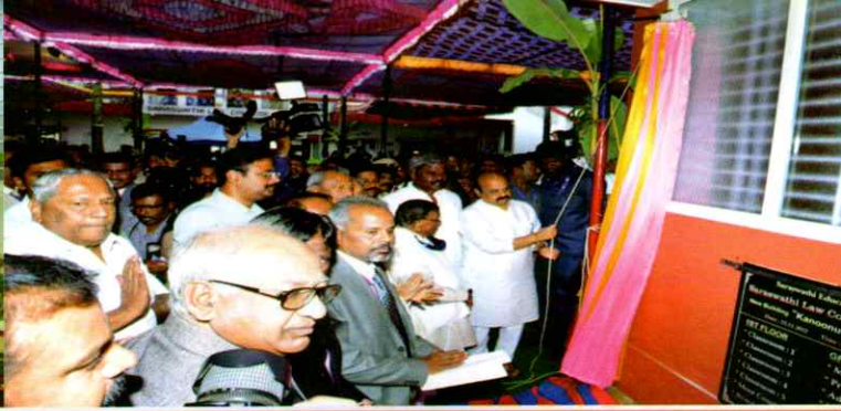
Sri Basavaraj Bommai, Chief Minister of Karnataka Inagurating of New Building 'Kanunu Soudha'