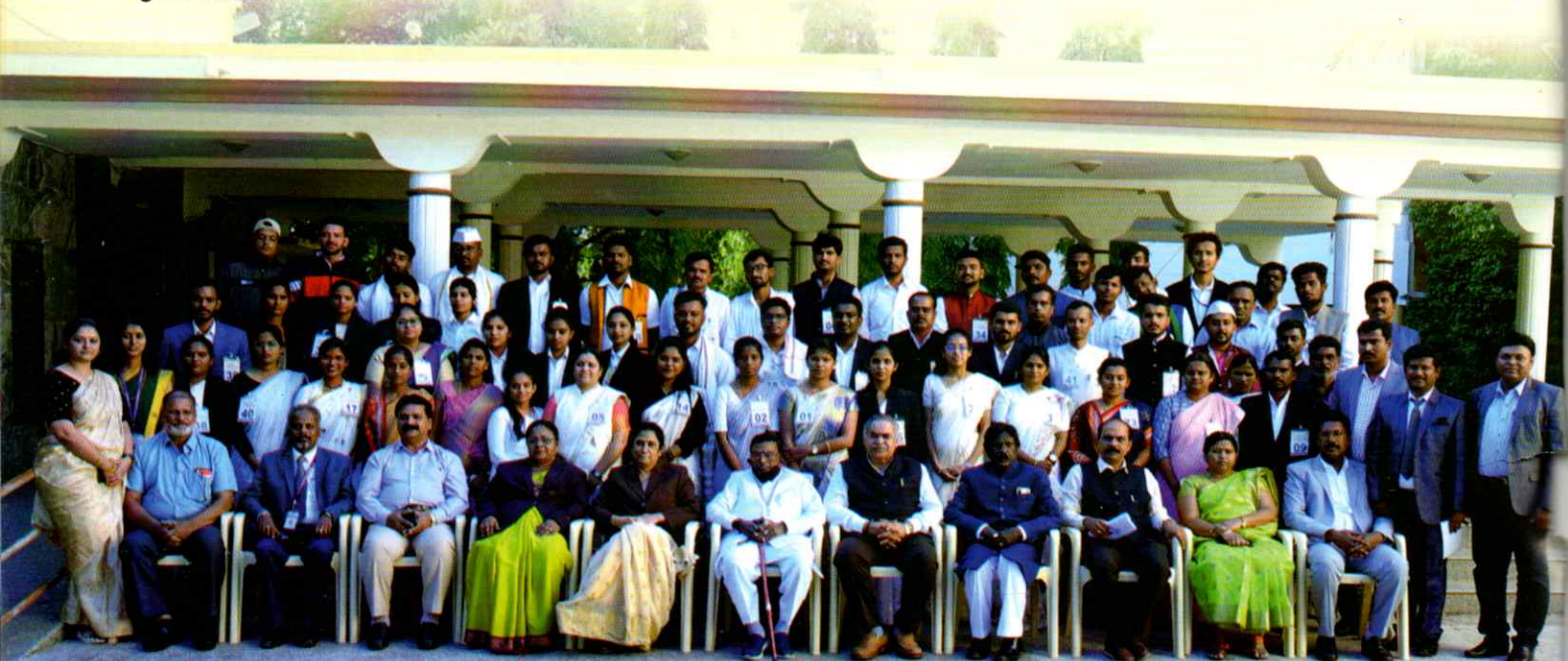
Dignitaries & Participants on the occasion of Model Assembly organised in association with KILPAR, Bangalore

ICT facilities are provided in some of the class rooms, library and laboratory. The Karnataka State Law University examination branch conducts written examination at the Institution in every subject. The total number of marks earmarked per subject, treated as one paper, are 100-80 marks are for the written examination and 20 marks as internal assessment. The Institution has a Students Grievance Redressal Cell, which takes care of receiving and redressing the students grievances.