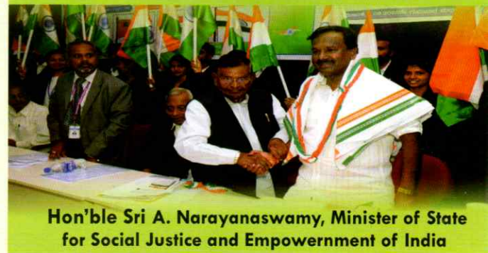
Hon'ble Sri A. Narayanaswamy, Minister of State for Social Justice and Empowerment of India