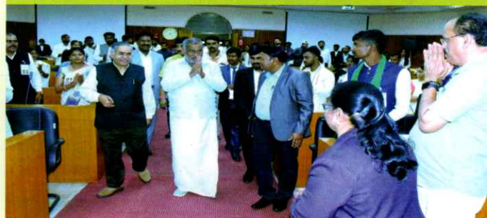
Hon'ble Sri J.C. Madhu Swamy Minister of Law of Parliament