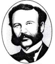
Jean Henry Dunant Founder of Red Cross