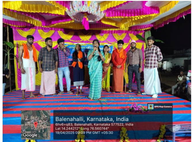
NSS volunteers have been creating awareness in villagers on superstition through skit