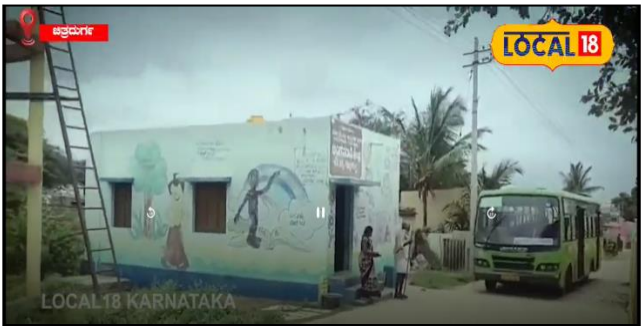
Traffic of Govt. Bus in the Jodichikkenahalli Village