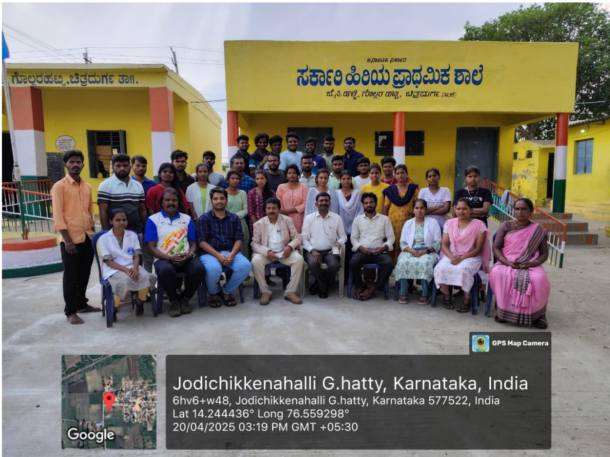
Group photograph of NSS Volunteers and Staff of the Akshaya Global Hospital and Sujay Rural and Urban Development Cultural Education Service Trust, Chitradurga after the Health Checkup Programme on the fourth day