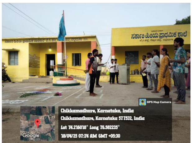
Proceedings of NSS activities on second day