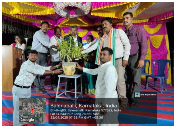
Inauguration through watering to the plant carrying out by Chief Guests & NSS Volunteers