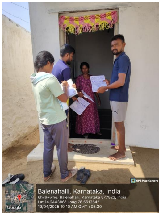
Distributing of Pamphlets of Free Health Checkup camp conducted by NSS Unit for the villagers