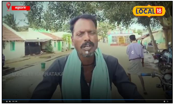
The villagers expressing their happiness and paid their gratitude to the NSS Volunteers through Social Media