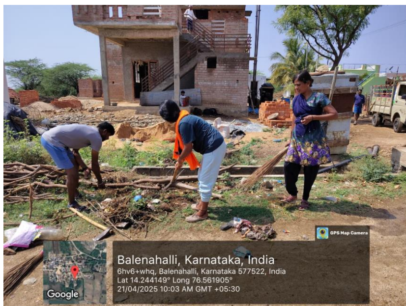
Clean Drive in the village streets by the NSS volunteers on fifth Day