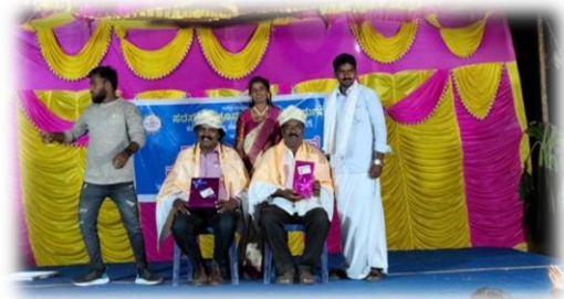
Glimpse of the throughout NSS Camp