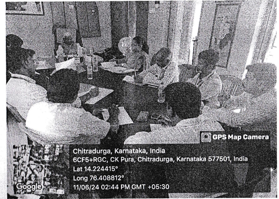
Photographs of Disciplinary Committee Meeting held on 11/06/2024