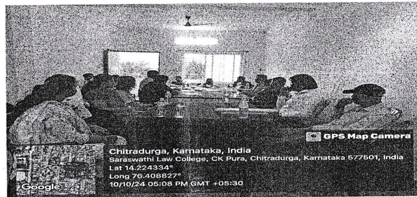
Photographs of Disciplinary Committee Meeting held on 10/10/2024